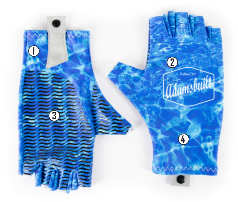
Available in sizes S/M, M/L, L/XL