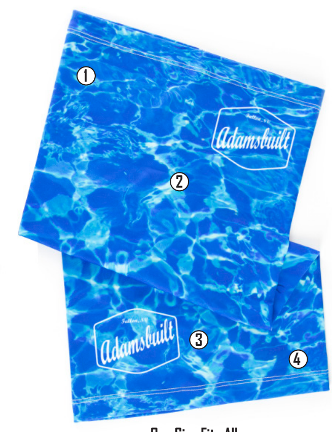
One Size Fits All